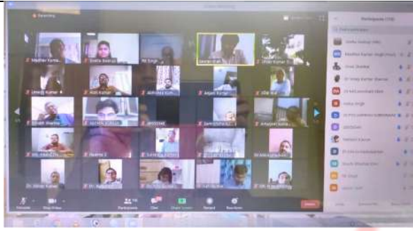
Participants in the Webinar_1