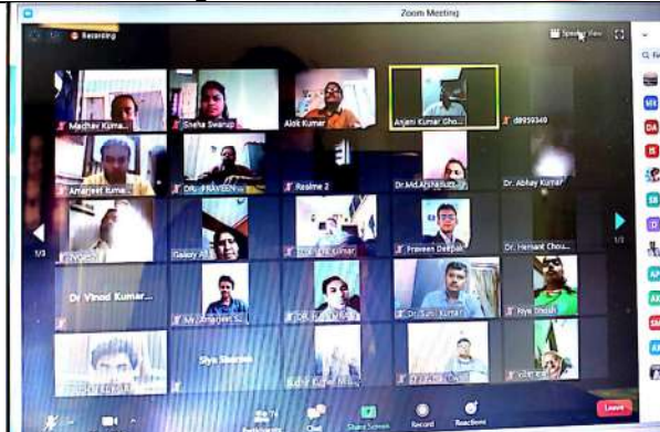
Participants in the Webinar_3