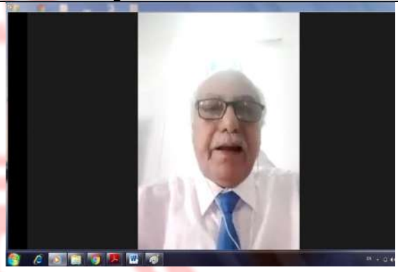
Hon'ble VC, Magadh University