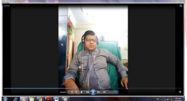
Principal, S. S. College, Jehanabad