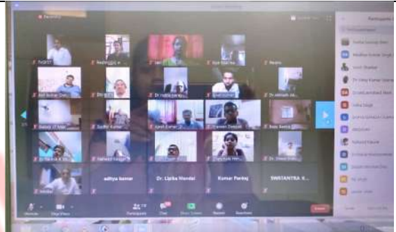
Participants in the Webinar_2